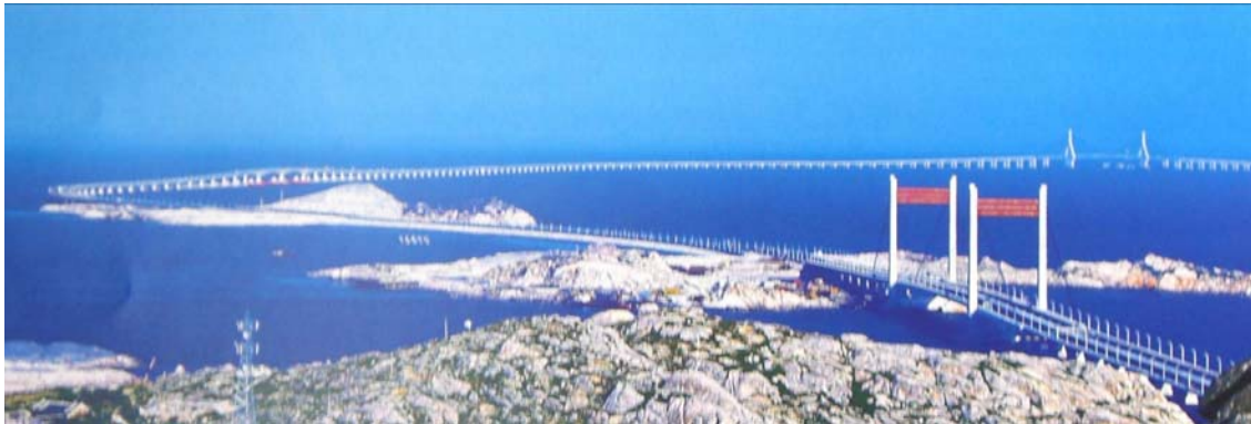
Fig. 1 Donghai Bridge in Shanghai, China