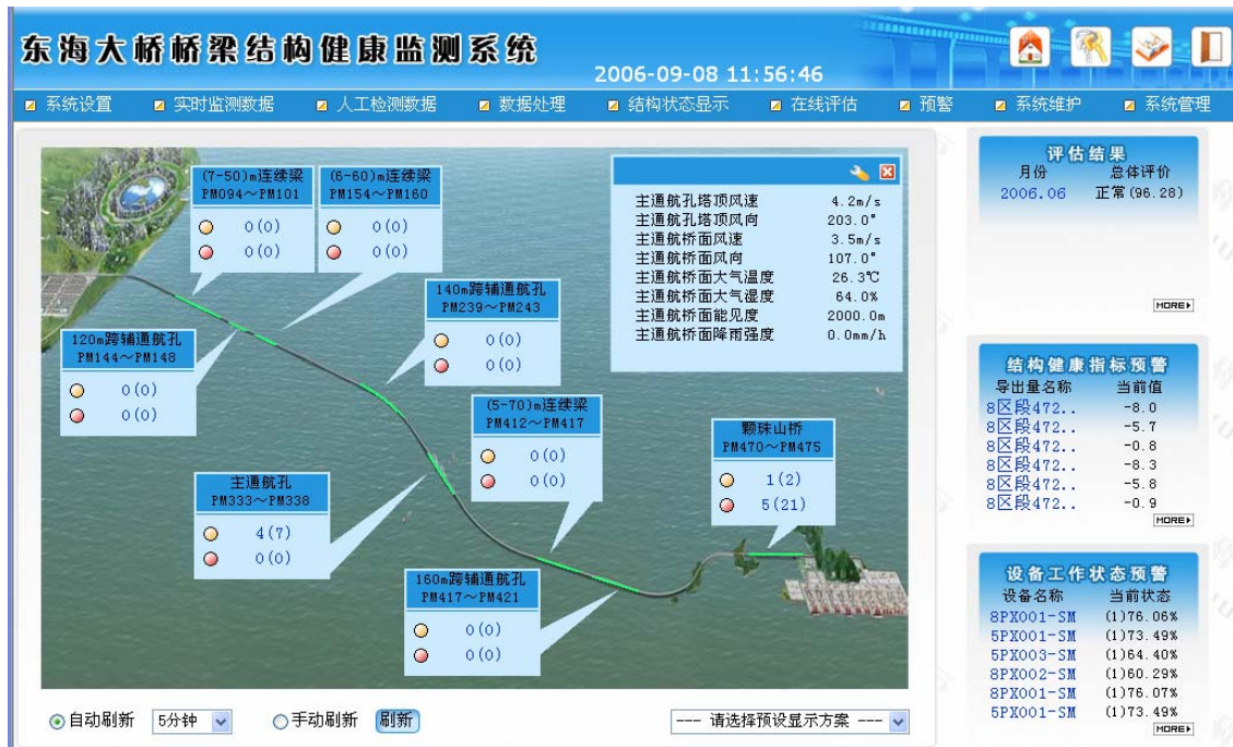
Fig. 3 Main features of SHMSDH

The software for SHMSDH was developed and the system can be accessed via internet by authorized users (Fig. 3). The maintenance engineers can monitor the operation state of the bridge. The researchers can access the data base to download the historical data and get real time data for analysis. The administrator can set the system parameters, change the data sampling rule, and maintain the sensors and other hardware online.